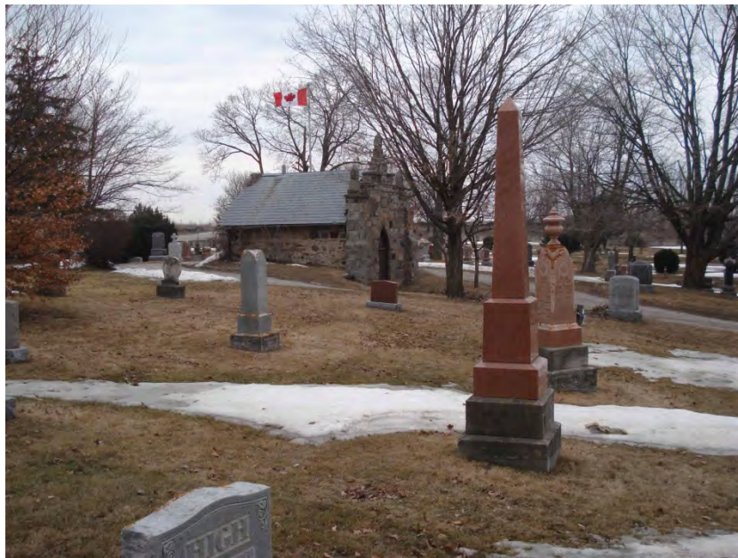
Maple Cemetery, Major Mackenzie Dr