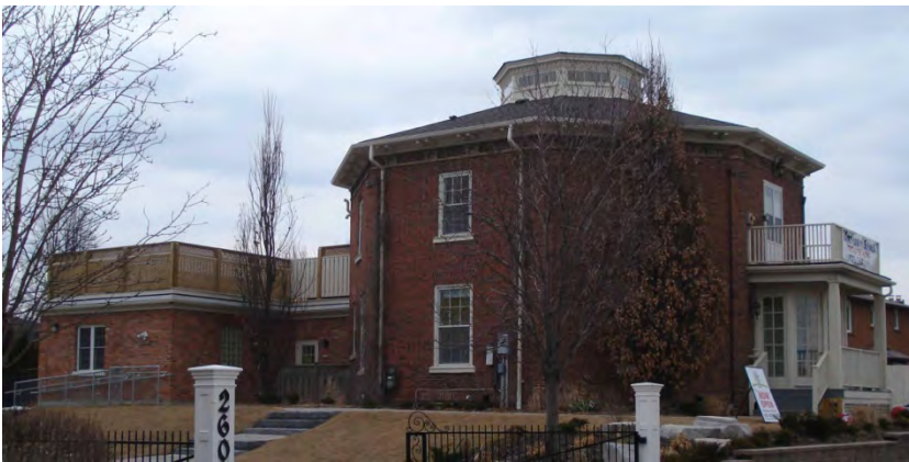
Octagonal House, Maple