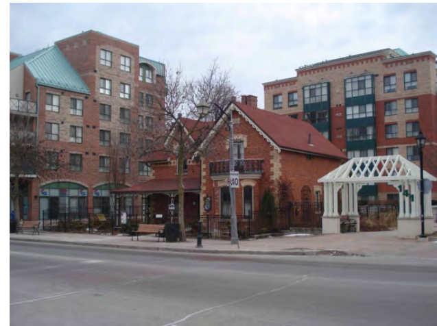
Wallace House, Woodbridge