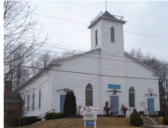
Holy Trinity Church, Thornhill