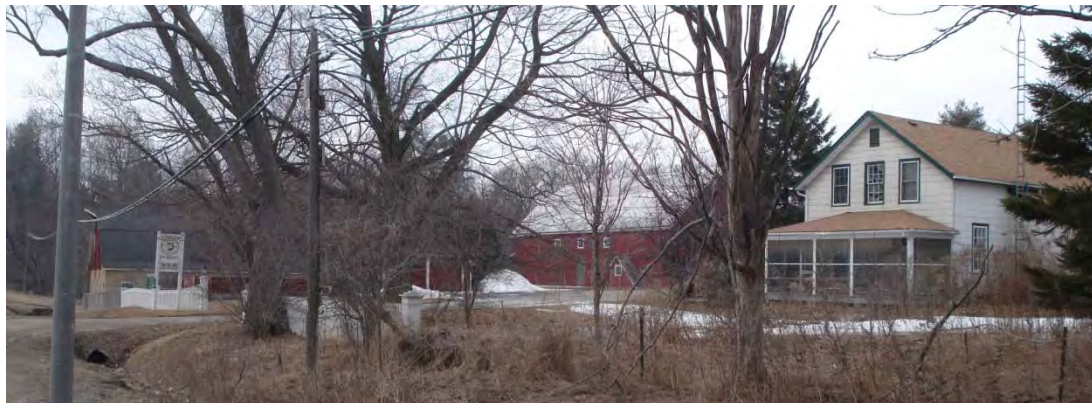
Remnants of village of Patterson, Major Mackenzie Dr