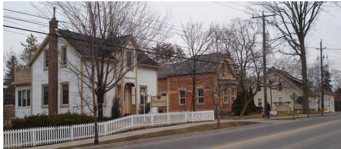
Centre Street, Thornhill