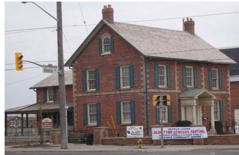
Noble House, Maple