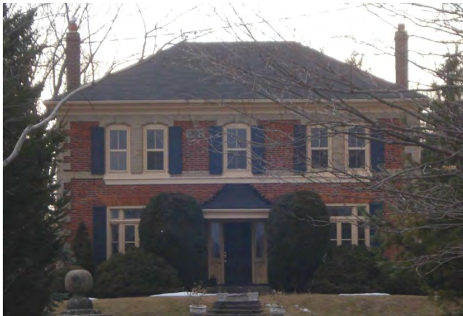
Capner House, 10072 Islington Ave.