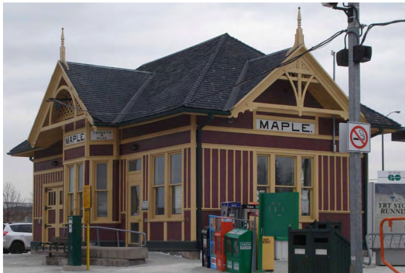
Maple Train Station, Station Street, Maple