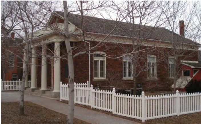
Memorial Hall, Vellore