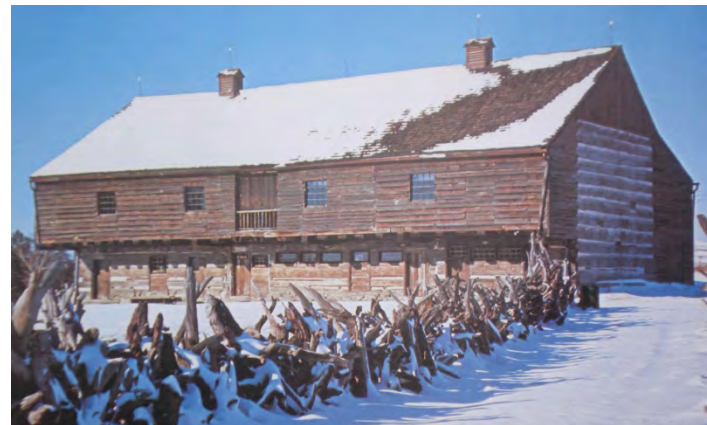
Dalziel Barn, 7060 Jane Street