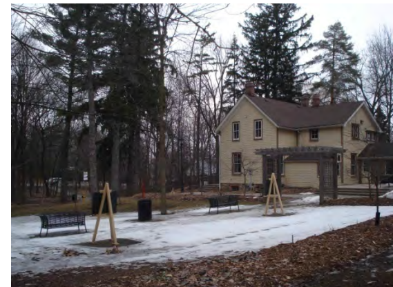
Example: MacDonald House, 121 Centre Street, Thornhill