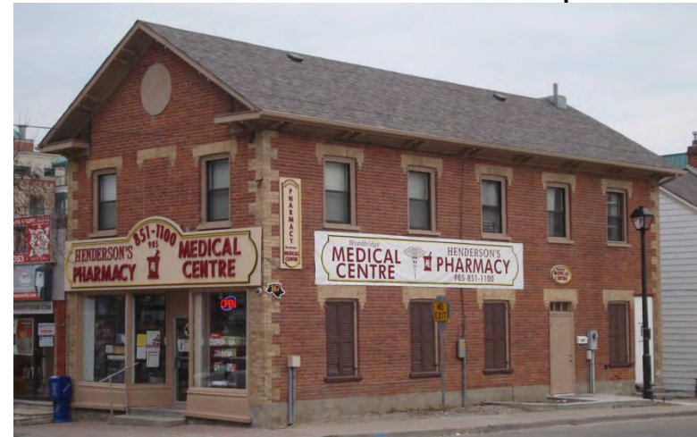
Dominion Exchange, Woodbridge