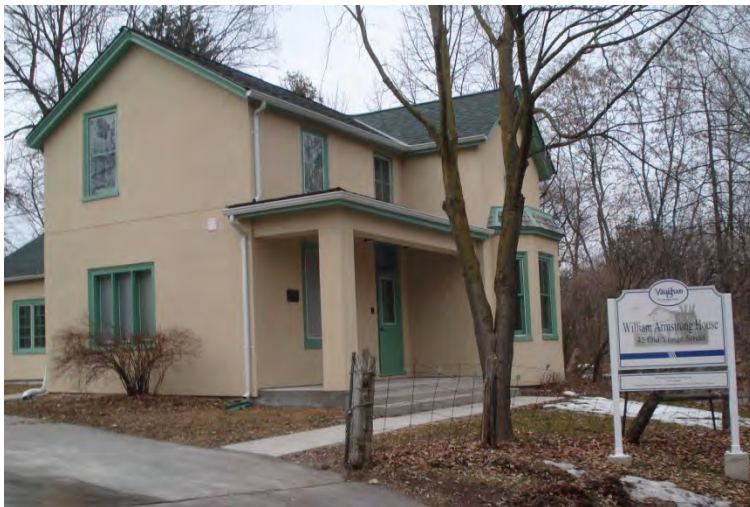
Armstrong House, Thornhill