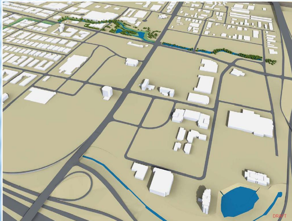
Future built condition