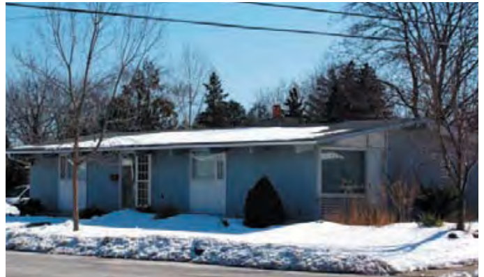
7845 Kipling Avenue, Woodbridge

This style emphasized horizontality: flat roofs without parapets, sometimes with overhangs. An appearance of thinness and lightness was created in deliberate contrast to surrounding buildings. Later variations were forced to seek contrast using different forms. Stucco, concrete or smooth brick walls appeared as undecorated neutral surfaces. Extensive areas of glass, usually in horizontal bands, were integrated in the wall plane. As the most popular subtypes of Contempo houses, Ranch Style and Split-level style are characterized by their one-story, pitched-roof construction, integral garage or car-port, wood or brick exterior walls, sliding and picture windows, and sliding doors leading to patios.