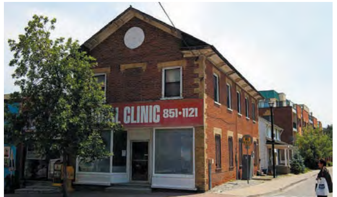
167 Woodbridge Avenue, Woodbridge

The Classical Revival was an analytical, scientific, and sometimes dogmatic revival based on intensive studies of Greek and Roman buildings. Unlike the Neoclassical Style that used Classical motifs and adornments on Georgian or other traditional floor plans, the Classical Revival was concerned with the application of Greek plans and proportions to civic buildings. Schools, libraries, government offices, and most other civic buildings were built in the Classical Revival style.