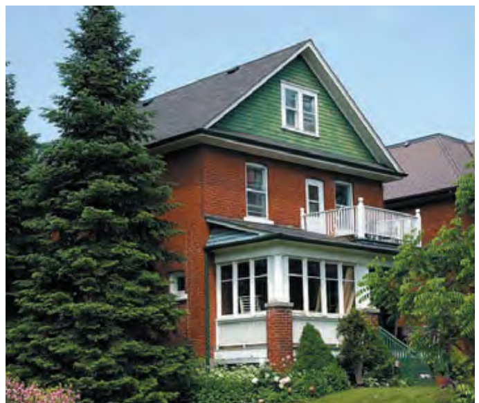
50 Wallace Street, Woodbridge

The style is a precursor to the simplified styles of the 20th century. Many of the Classical features - colonettes, voussoirs, keystones, etc. - are part of this style, but they are applied sparingly and with guarded understatement. Finials and cresting are absent. Cornice brackets and braces are block-like and openings are fitted with flat arches or plain stone lintels. Edwardian Classicism provided simple, balanced designs, straight rooflines, un-complicated ornament, and relatively maintenance-free detailing. A subtype of Edwardian is "Foursquare" with equal sides and a massed, cubical shape.