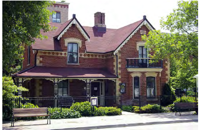
137 Woodbridge Avenue, Wallace House, Woodbridge

In Ontario, a Victorian style building can be seen as any building built between 1840 and 1900 that doesn't fit into any of the aforementioned categories. It encompasses a large group of buildings constructed in brick, stone, and timber, using an eclectic mixture of Classical and Gothic motifs. 19th century urban centres are packed with lovely residences and small commercial buildings made with bay windows, stained glass, ornamental string courses, and elegant entrances.