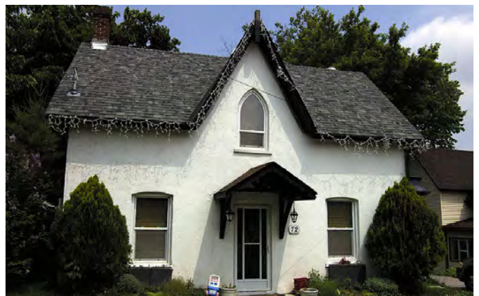
72 William Street, Woodbridge

Generally symmetrical in organization from part to part, though independently symmetrical parts might be assembled irregularly. Both roof pitches and gables were steep. Wall continuity was broken up by projecting or recessed bays. Verticality was emphasized wherever possible, with features such as board and batten cladding, crenellations, extra gables, and pointed arches for windows and entrances. Polychrome brickwork heightened the decorative effects.