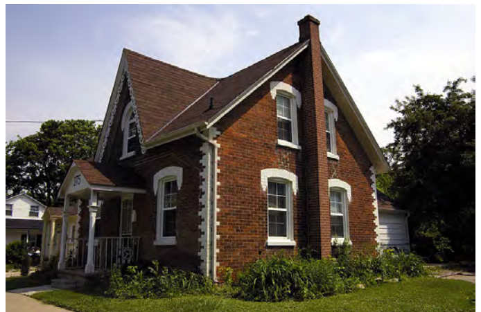
175 Clarence Street, Woodbridge

The Ontario Vernacular style grew out of the Gothic Revival and Neo-Gothic. A simple rectangular plan with a medium pitched front to back roof and steeply pitched central dormer is the hallmark of the style. Ornamentation may include traces of Loyalist, Georgian, or Gothic detailing in a spare simplified form.