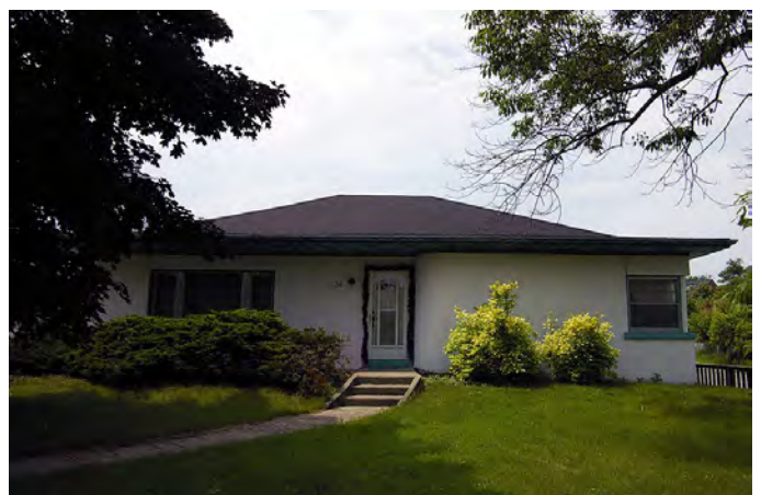
36 Clarence Street, Woodbridge

Moderne emphasized horizontality (flat roofs, horizontal window bands, rounded corners) and asymmetry. Smooth stucco walls were typical of Moderne structures. Moderne continued its horizontal planes and curves in window mullions and railings. Many new materials and techniques were introduced or adapted in new forms: glass block, stainless steel, vitrolite (carrara glass), terrazzo, and indirect lighting.