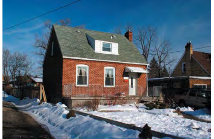
8233 Kipling Avenue, Woodbridge

Victory housing was designed to be permanent and comfortable, large enough for a single family. It was meant to provide housing for defense industry workers, and later for returning WWII veterans. Most of this housing was prefabricated. Once a street was constructed, it was neat, tidy, and uniform. The houses were generally one-and-a-half storey with a steep roof, shallow eaves and no dormers. Multi-paned sash windows supplied light to the first floor and through the gable ends. The finish is different in every center, but clapboard was the most common.