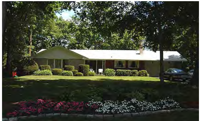
Image Credit: Ranch Style, Erindale, Ontario, www.ontarioarchitecture.com

Image Credit: California, www.wikipedia.org , Sketch by GBCA