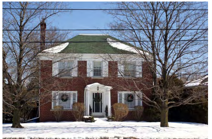
7883 Kipling Avenue, Woodbridge

This style is comprised of simple rectangular volumes with shallow gabled or hipped roofs and symmetrical window and door arrangements. Small dormers were hipped or gabled. A selfconscious but inaccurate emulation of earlier styles, it mixed American Colonial with Upper Canadian Georgian. Clad in shingle, clapboard or brick, these revivals featured restrained Classical detailing in columns, engaged piers and cornices. Windows were shuttered and sometimes small-paned.