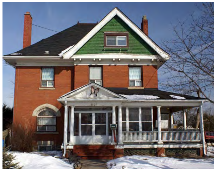
8127 Kipling Avenue, Woodbridge

This style is distinguished by irregular plans, elevations and silhouettes with both hipped and gabled roofs. Structures built in this style featured projecting polygonal bays, turrets, towers and chimneys. Queen Anne Revival buildings generally demonstrate a tremendous variety and complexity of detail. Spindework and other intricate woodwork adorned porch supports and gable ends. Unrestricted by convention, Classical features such as Palladian windows appeared in gables, with decorated pediments.