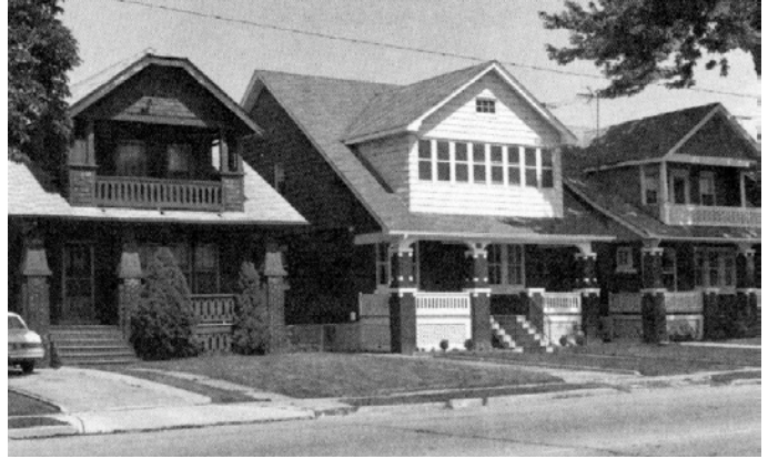
Image Credit: Windsor, Ontario, Ontario Architecture, 1874 to the present , John Blumenson

Image Credit: London, Ontario, www.ontarioarchitecture.com , Sketch by GBCA