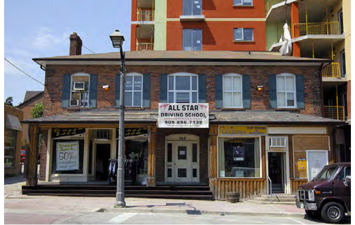
160 & 166 Woodbridge Avenue, Woodbridge

This style is generally box-like, symmetrical elevations, with Classical (via Renaissance) proportions. Five-bay fronts, with two windows on each side of a central doorway, were most characteristic. Structures were from one to three storeys, but usually two, with centre-hall plan. Larger compositions comprised a central block with symmetrical wings. The typically side-gabled roof was often pitched high enough to allow a half-roof in the attic.