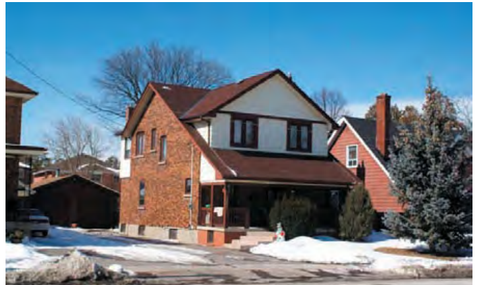
7844 Kipling Avenue, Woodbridge

Bungalows are generally one or one-and-a half storey homes with broad, low-pitched, roofs that seem to blanket the building. Large porches, overhangs, and verandas link the bungalow with the usually ample exterior space surrounding the building. Bungalows are almost exclusively residential and are often made of rustic materials such as stone and brick. The roofs are usually constructed with exposed structural framing.