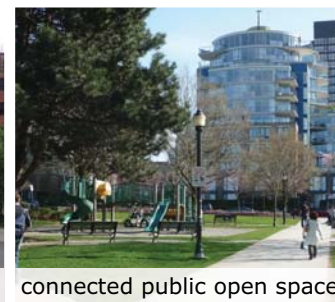
connected public open space