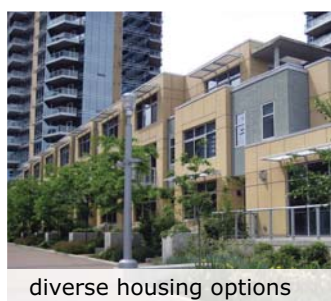
diverse housing options