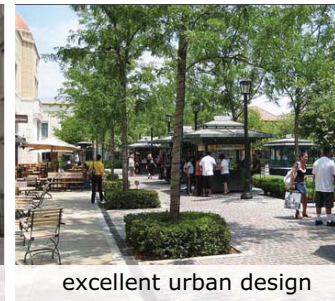
excellent urban design