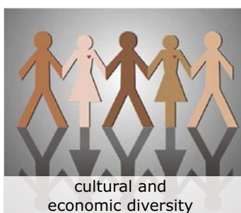
cultural and economic diversity