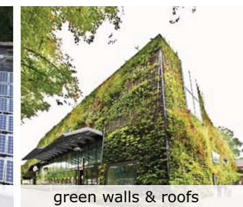
green walls & roofs