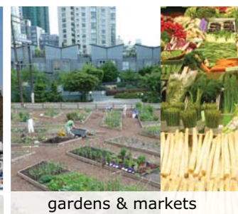
gardens & markets